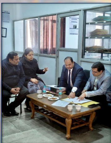
External Academic Audit Glimpses