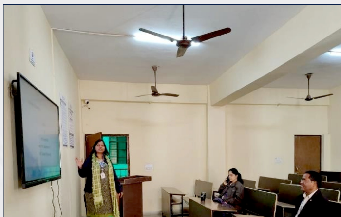
Glimpses of Faculty Presentation Programs