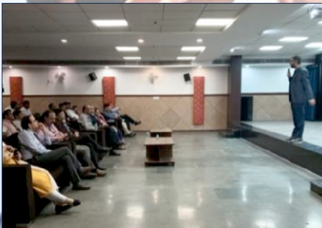
Glimpses of Expert Talk