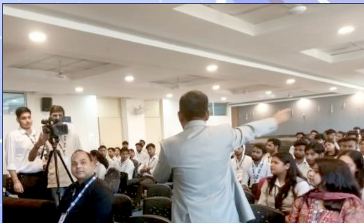
Glimpses of Event