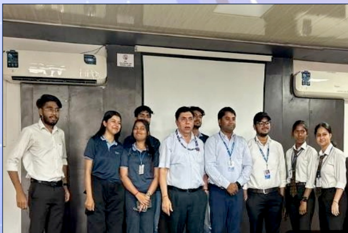
Glimpses of the Session