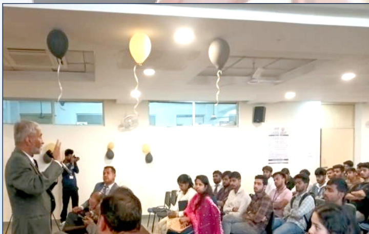
Glimpses of Workshop