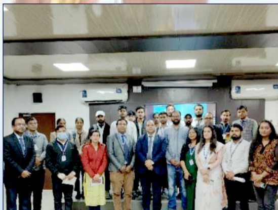
Glimpses of MDP