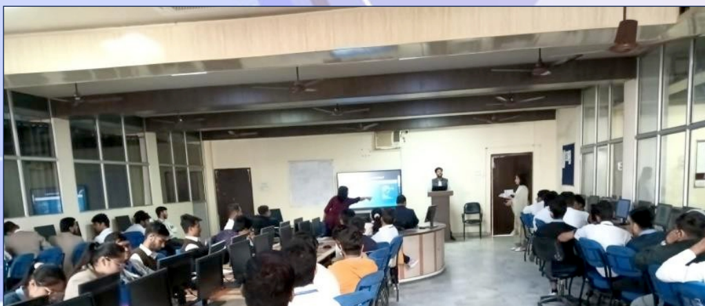
Students attending workshop and learning about Achieving Problem Solution fit & Product market fit